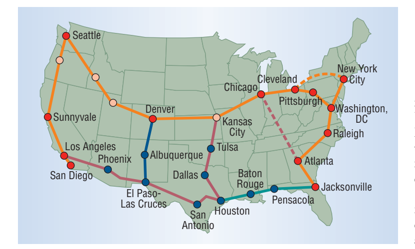
Figure 1. National LambdaRail. Using this backbone, the virtual testbed can support larger traffic volumes, with PlanetLab nodes aggregating traffic from local sites and feeding it to the backbone nodes.

that content delivery networks operate. The local representative can then translate the packets into an internal format for delivery to the server and translate the packets back to Internet format for the reply. In addition, developers can use this approach to point to multiple virtual testbeds.